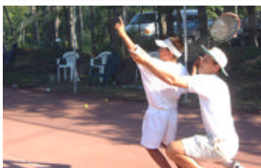
Personalized Daily Instruction