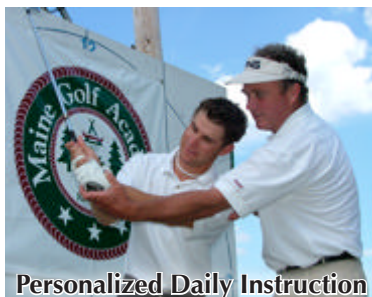
Personalized Daily Instruction

All the fun of a summer camp - All the instruction of a sports camp